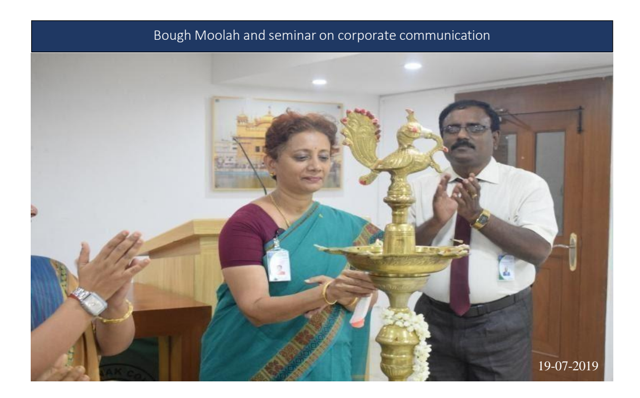
Bough Moolah and seminar on corporate communication